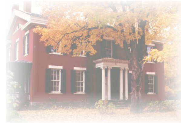
The Hand House

8273 RIVER STREET PO BOX 396 ELIZABETHTOWN, NY 12932