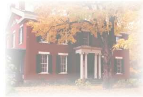
The Hand House Home of the Bruce L. Crary Foundation, Inc.

8273 RIVER STREET PO BOX 396 ELIZABETHTOWN, NY 12932