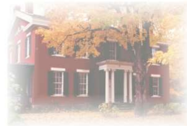
The Hand House Home of the Bruce L. Crary Foundation, Inc.

8273 RIVER STREET PO BOX 396 ELIZABETHTOWN, NY 12932