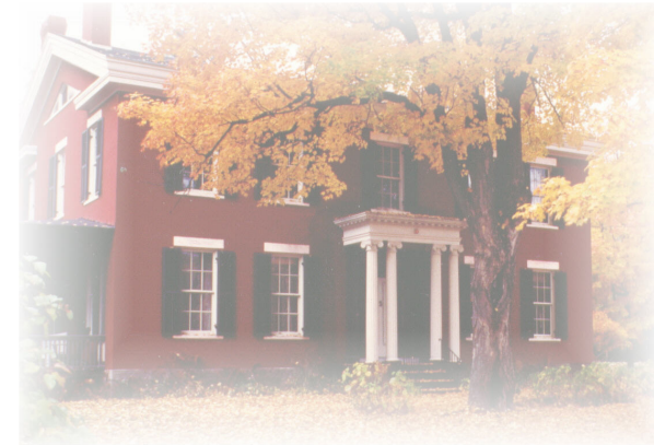
The Hand House

8273 RIVER STREET PO BOX 396 ELIZABETHTOWN, NY 12932